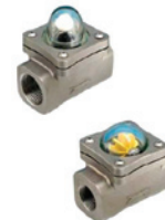
Visual Flow Indicators