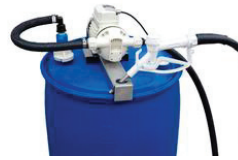
Drum Mounted Dispensers