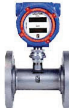
Turbine Flow Meters