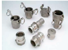
SS316, Brass, Aluminum & Polypropylene