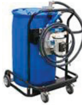
Portable Drum Dispensers