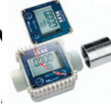
Urea (DEF) Flow Meters