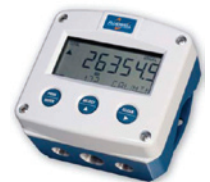
Display & Batch Controllers