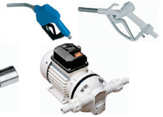
Urea (DEF) Nozzles & Pumps