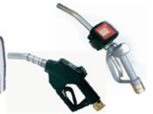
Nozzles and Nozzle Meters